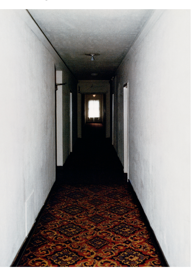
Steve Kahn, Corridor 6a, 1979/2013

The Corridor images, were originally photographed with Polaroid 108 color film, and then re-photographed on 4x5 transparency film to achieve a larger printed scale. These images were then displayed in four one-point perspectives.