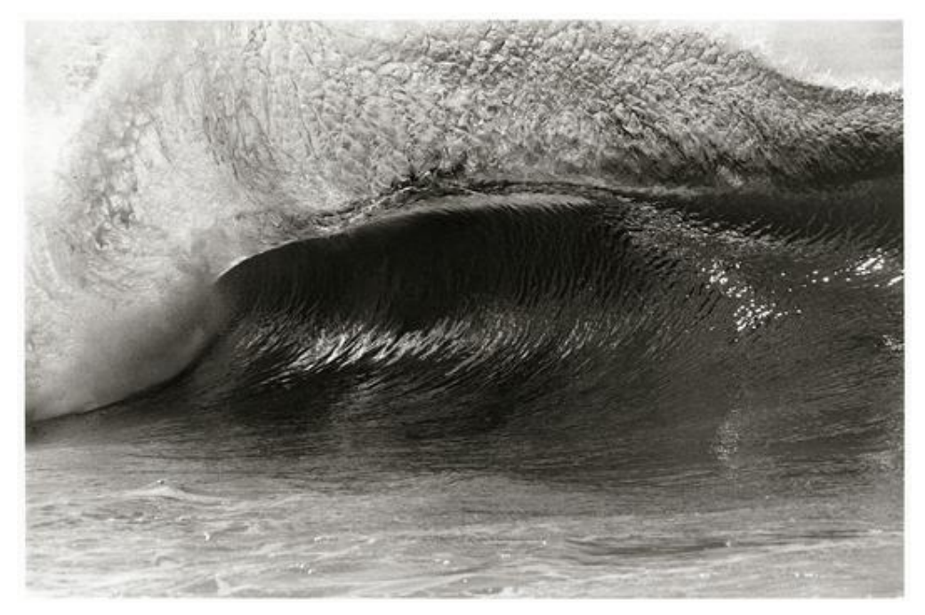
Anthony Friedkin, Ice Wave, Zuma Beach, CA, 2002

Along with this connectivity, the three photographers represented in Drawn to Light, have lived and worked in Los Angeles during the same period, thus uniting each photographer's work, and its relation to the history of photography in California.